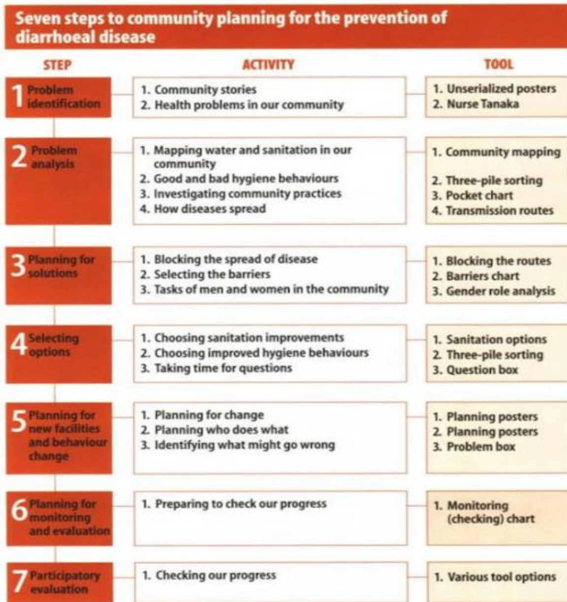
Fig 7.1.2: Steps in PHAST (Bockhorn, 2012)

eighth stages are for monitoring and evaluation. (Kar, 2010)t.